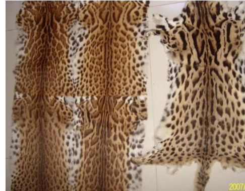
Asian Leopard Cat ( Prionailurus bengaliensis )

Dorsal Markings – The pattern of markings along the back