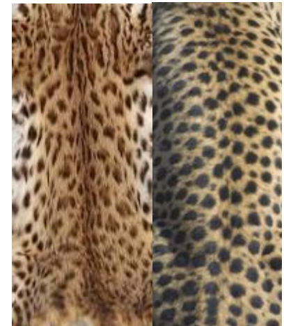
SBT Bengal Cat

Combination of Small Spots or Rosettes with a Minimum of at Least Two Longer Spots