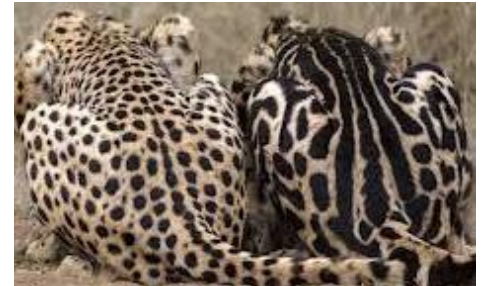
Cheetah ( Acinonyx jubatus )

Consider only the dorsal (back) pattern from just past the shoulder/front leg to in front of the hip. Please rate them as follows: